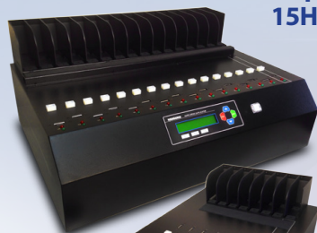
KanguruClone™ Hard Drive PRO Series Duplicators (23HD, 15HD and 7HD-SATA)