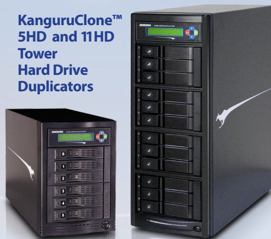
KanguruClone™ 5HD and 11HD Tower Hard Drive Duplicators

Easily duplicate Hard Drives, SSDs and PCIe SSDs all in one batch.