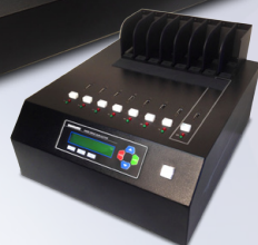
Daisy-Chain Compatible Duplicators