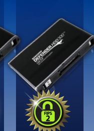
Defender HDD300™ SSD300™