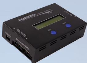
Kanguru Mobile Clone HD Duplicator™ 1-to-1 Hard Drive Duplicator

Kanguru Hard Drive Duplicators are ultra high performance Hard Drive Duplicators that can copy up to several hard drives and solid state drives simultaneously. These stand-alone units will clone the boot sector, operating system, applications and data at the touch of a button.